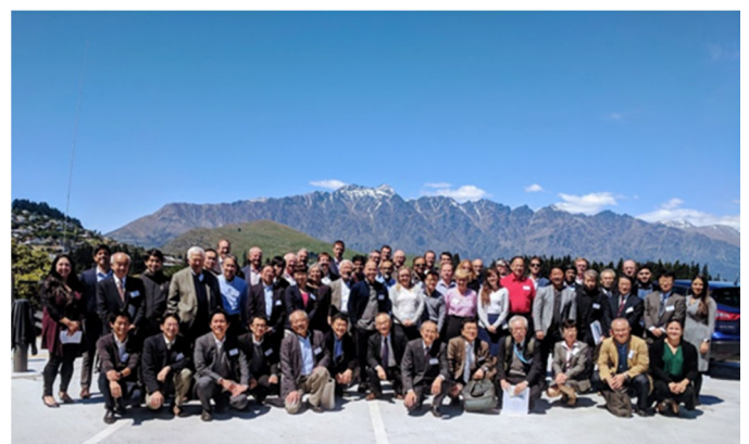
写真 4 参加者全員による記念撮影 Photo4 Commemorative photo of all attendees