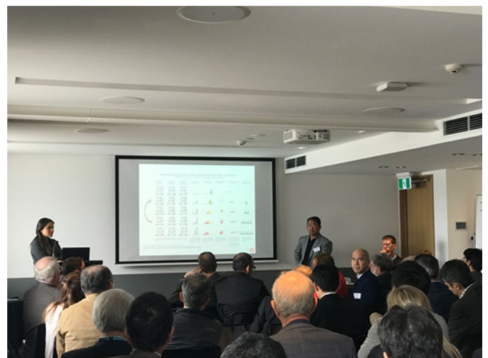
写真2 Discussionの様子 Photo2 Scene of discussion

4-2. Connecting Physical Damage to Social and Economic